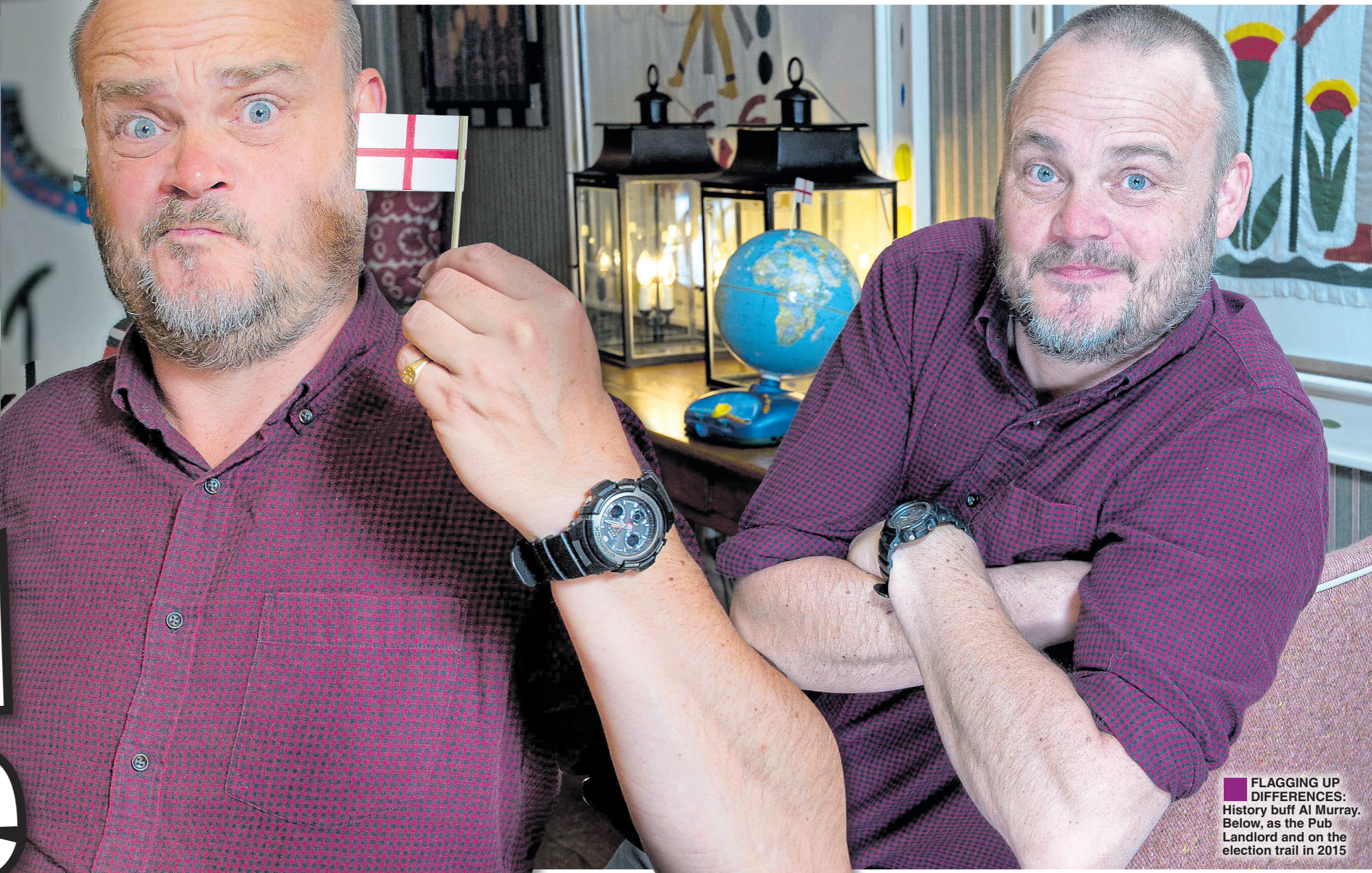
FLAGGING UP DIFFERENCES: History buff Al Murray. Below, as the Pub Landlord and on the election trail in 2015